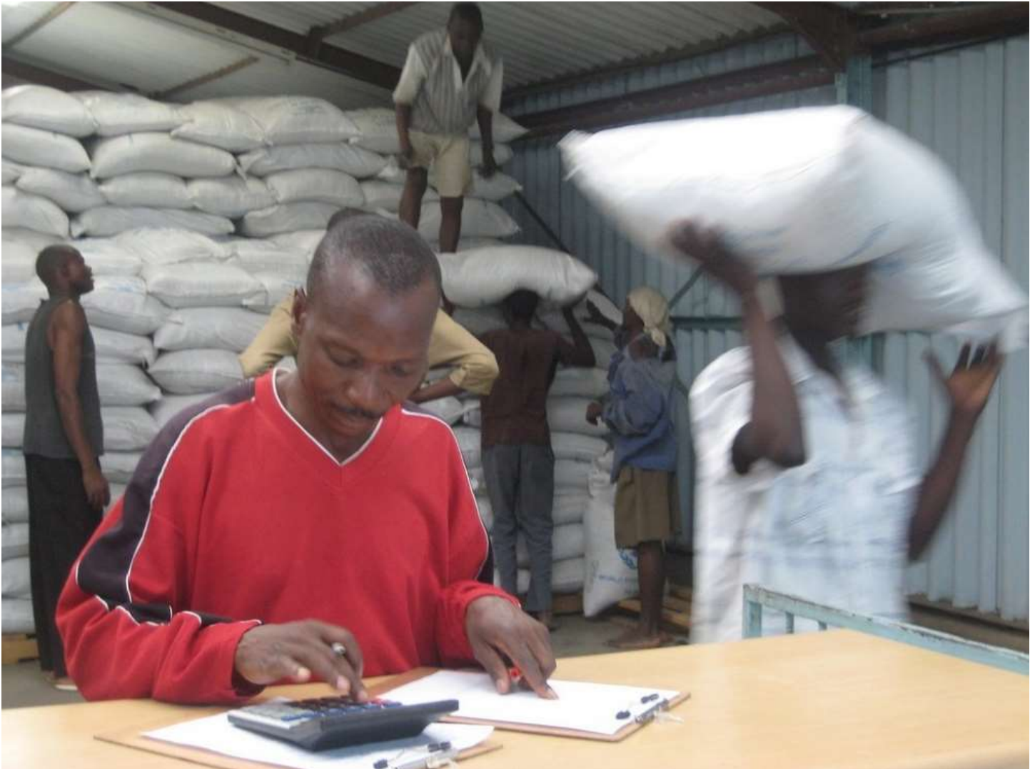
World Food Programme warehouse.

Resilience building is not a new phenomenon. It's a fashionable phrase included in just about every humanitarian and development document. It has institutional support expressed through the 2005-2015 Hyogo Framework of Action, and its successor, the Sendai Framework.