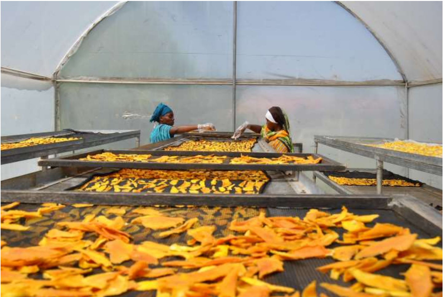
Members of a women's cooperative drying mangoes

IT WAS A MODEST INTERVENTION — a drop in the ocean of global climate finance — yet it has made the difference between profit and loss for a group of businesswomen in southeast Kenya's Makueni County.