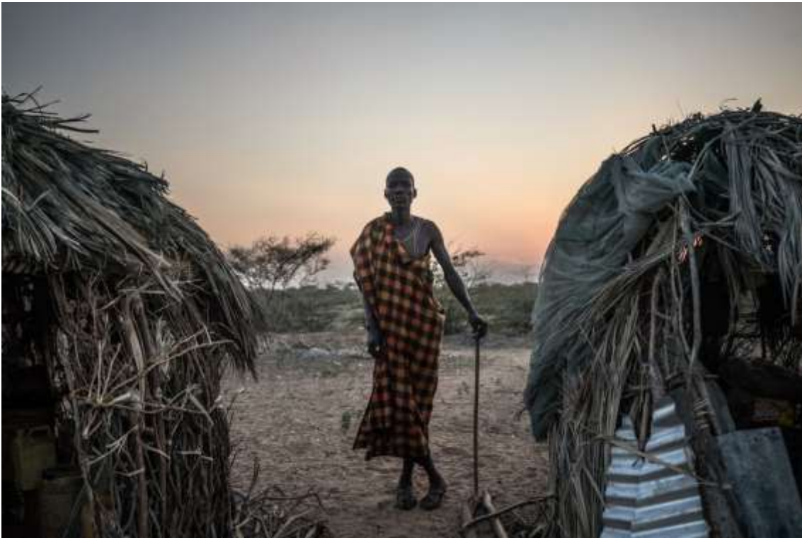
A livestock-raiser in Kenya's Turkana County.

IN DRYLAND AREAS ACROSS THE WORLD , tens of millions of people raise domesticated animals on open rangeland. Extreme variations in weather mean such pastoralists have to be highly adaptive and deploy a range of specialised skills. Climate change is making this way of life increasingly precarious.