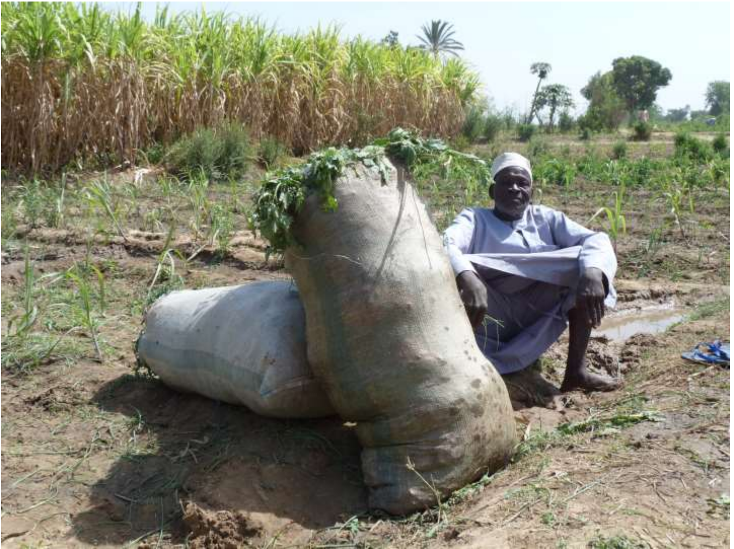
A farmer waits for a truck to take his harvest to market.

ON THE OUTSKIRTS of Nigeria's northern city of Kano is bustling Dawanau, West Africa's largest grain market. Fortunes change hands here daily, with sacks of millet, sorghum, and cowpeas loaded onto trucks for delivery to countries as far afield as Chad, Mali, and Senegal.