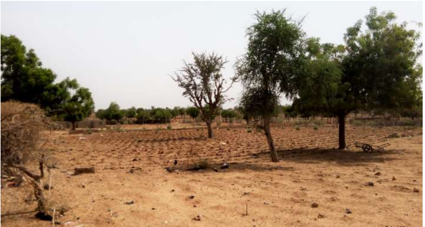
Degraded farmland in northern Nigeria.