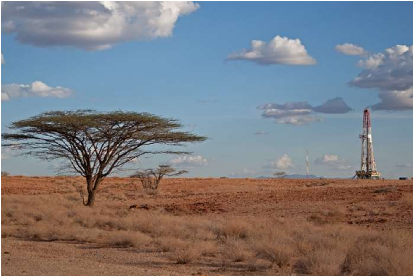
Oil exploration site in Turkana County.

REBECCA EKALE DOESN'T BELIEVE anything good can come from the black gold bonanza that will bring untold riches to arid Turkana, the poorest county in Kenya.