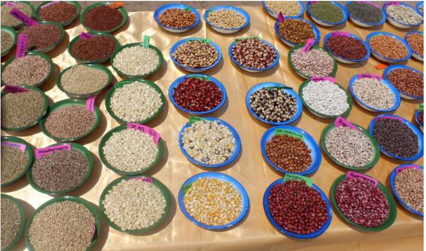
A community seedbank in Zimbabwe.

“SEED SECURITY IS FOOD SECURITY” is something of a mantra in developing world agronomy circles. In Zimbabwe, the adage is gradually being put into action by promoting the use of indigenous small grains threatened with extinction by the dominance of maize, both in fields and on dinner tables.