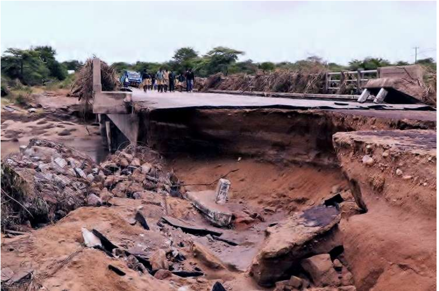
Recent rains have caused considerable damage to infrastructure.

Zonke has also had to learn to adapt. “We have adopted [the] cultivation of small-grain seeds on a much bigger scale than before, and new varieties of crops that are easier to grow but pay more,” she said.