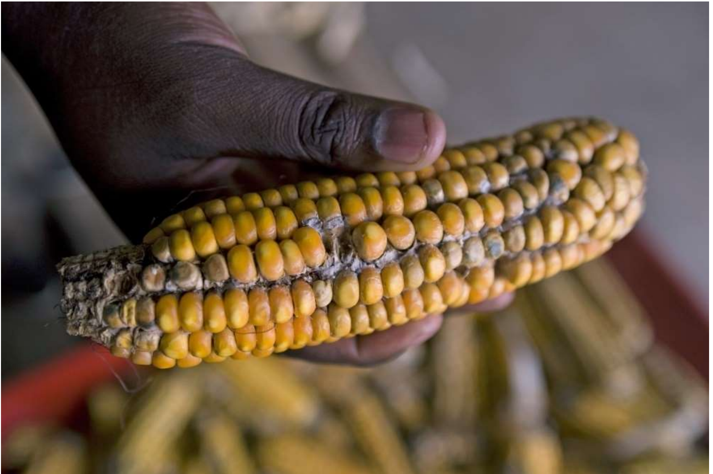
Blight-hit maize, Photo: Eva-Lotta Jansson/IRIN

CLIMATE CHANGE-INDUCED DISASTERS will keep on coming, as sure as the sun rises. But rather than governments and aid agencies swinging into belated – often chaotic – action after they’ve struck, the smarter move is to strengthen communities by building their resistance ahead of time.