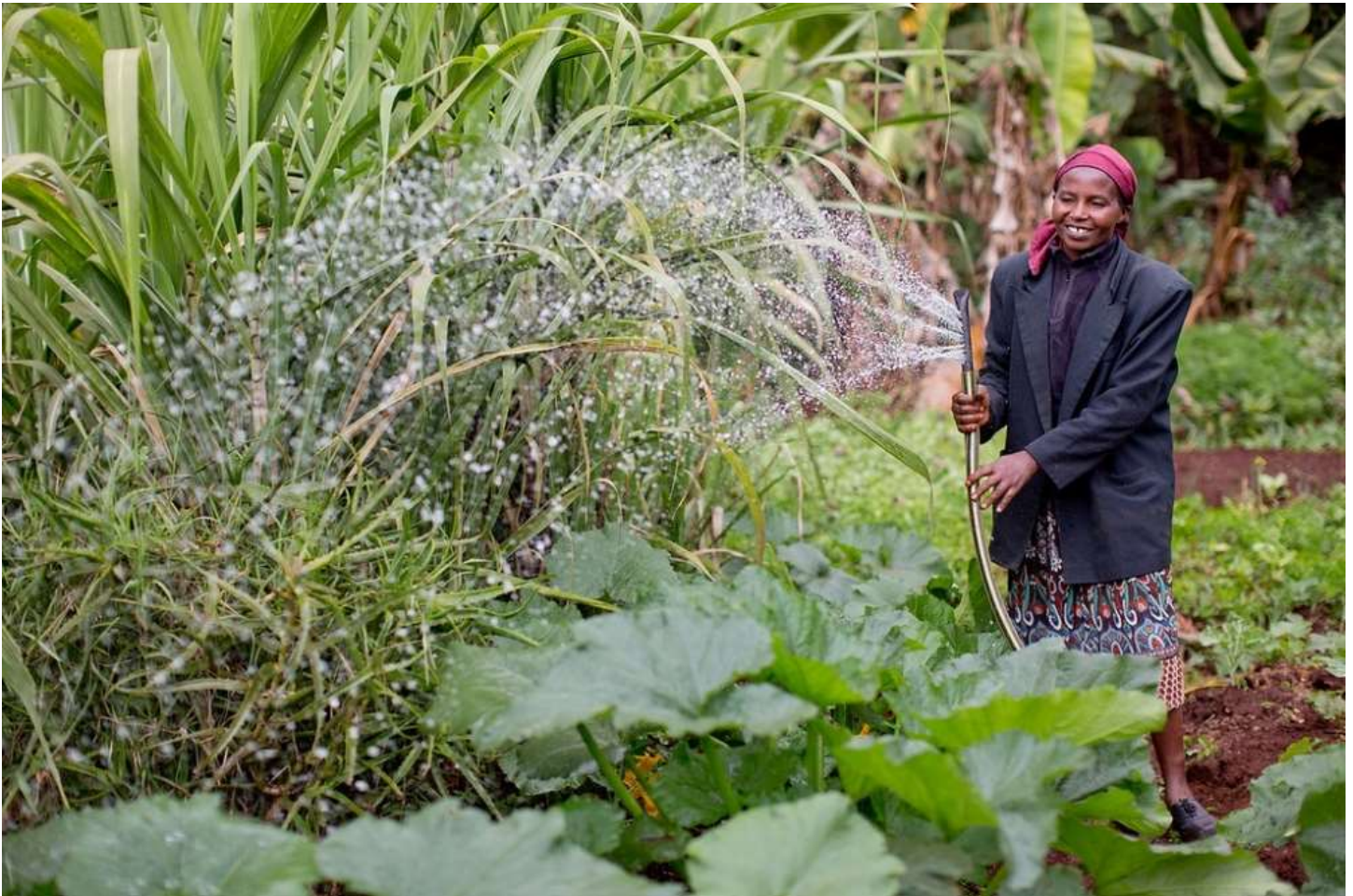
A smallholder farmer in Kenya.

AGRICULTURE IS THE MOST IMPORTANT sector of African economies, from the livelihoods it supports to the future jobs it can generate.