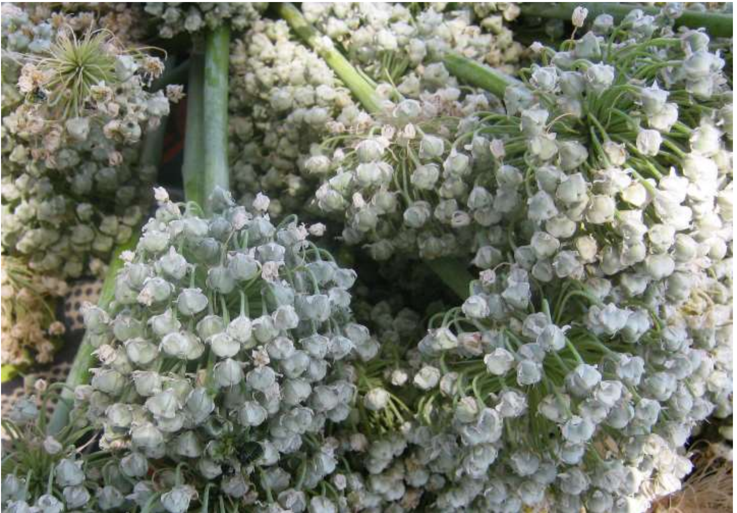
Seeds of success: the Violet de Galmi is a hardy variety of onion.

Biaye's farm also produces rice seeds – rice is a staple in Senegal – which it provides to farmers in the area. Once these farmers harvest their rice crops, they return the quantity of seeds they were given to the seed bank, plus an additional 25 percent that is held for that farmer for future planting. This means that every two years, participating rice farmers have enough seeds of their own to be self-sufficient.