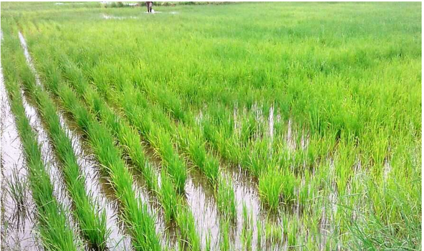
Rice plantation in Dioffior.

Senegal is "perpetually confronted with the adverse effects of climate change because of its 700-kilometre coastline which is impacted by the rising level of the sea, with the corollary of coastal erosion, the saline intrusion on farmland, the salinization of water resources and the destruction of infrastructure," Sarr wrote. "Because agriculture is primarily rain-fed, climate change risks compromising efforts to fight poverty and efforts to reach food self-sufficiency."