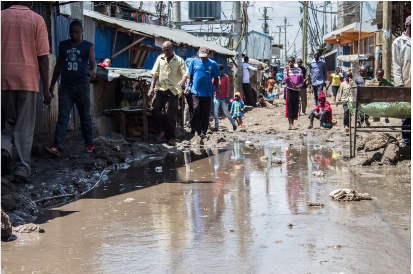
Mukuru after the rains.

LIVING IN THE KENYAN SLUM of Mukuru is hard enough, but when it rains it's downright miserable. Streets flood, sewage overflows, homes are inundated.