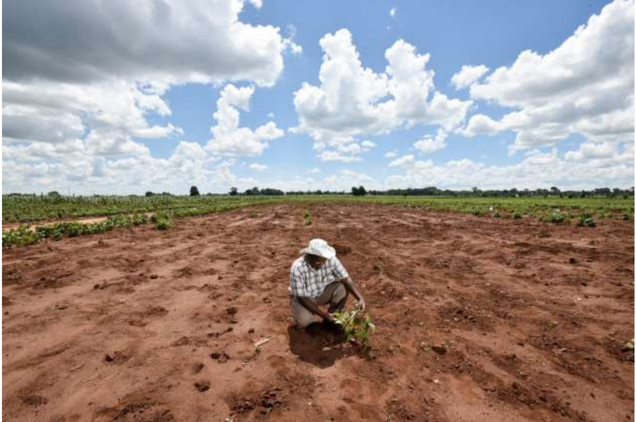
A farmer planting drought-tolerant beans.

There's next-to-nothing farmers can do to halt the various manifestations of climate change, such as droughts, floods, rising sea levels, and less predictable rainy seasons. But there are many ways they, and their governments, can cushion the blows of such shocks. As the articles in the following section illustrate, these "adaptation" strategies range from small changes on the farm to major policy interventions at the national level.