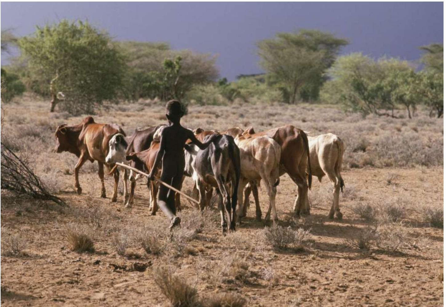
Many children in Turkana tend to livestock rather than attend school.

The drought has sent rates of global acute malnutrition soaring: in Turkana North sub-county, the rate is 30.7 percent, more than double the emergency threshold.