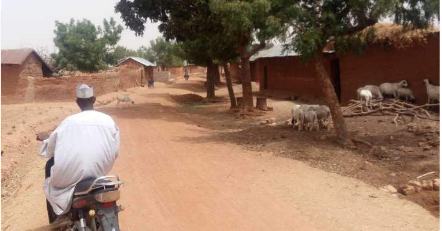
Godai village, in Nigeria's northwestern Kaduna state.

EVERYONE'S HEARD OF CLIMATE CHANGE , right? Global warming, stranded polar bears, droughts, floods, and pestilence – a terrifying prospect imprinted on all our minds.