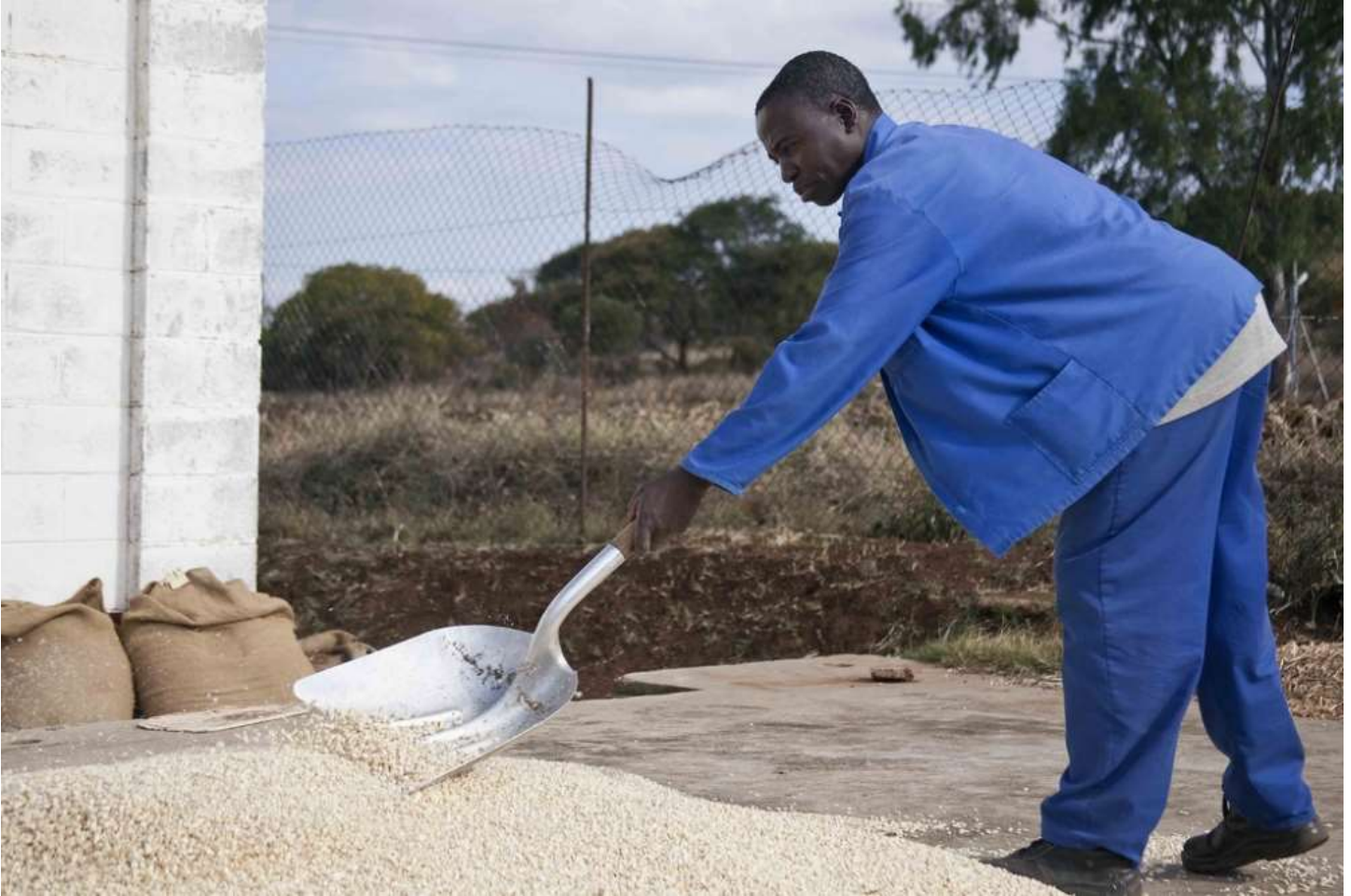
Many farmers feel left to their own devices.