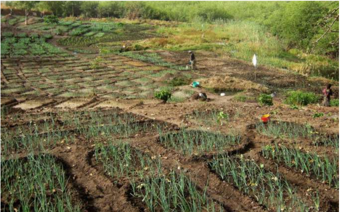
The village of Djimini is enjoying a new lease of life.

FOR SEVERAL DECADES , the prospect of a better life has prompted countless inhabitants of rural parts of Africa to head to cities. In Senegal's Fuladu region, a local initiative aimed at making agriculture more viable aims to reverse that trend. It revolves around seeds.