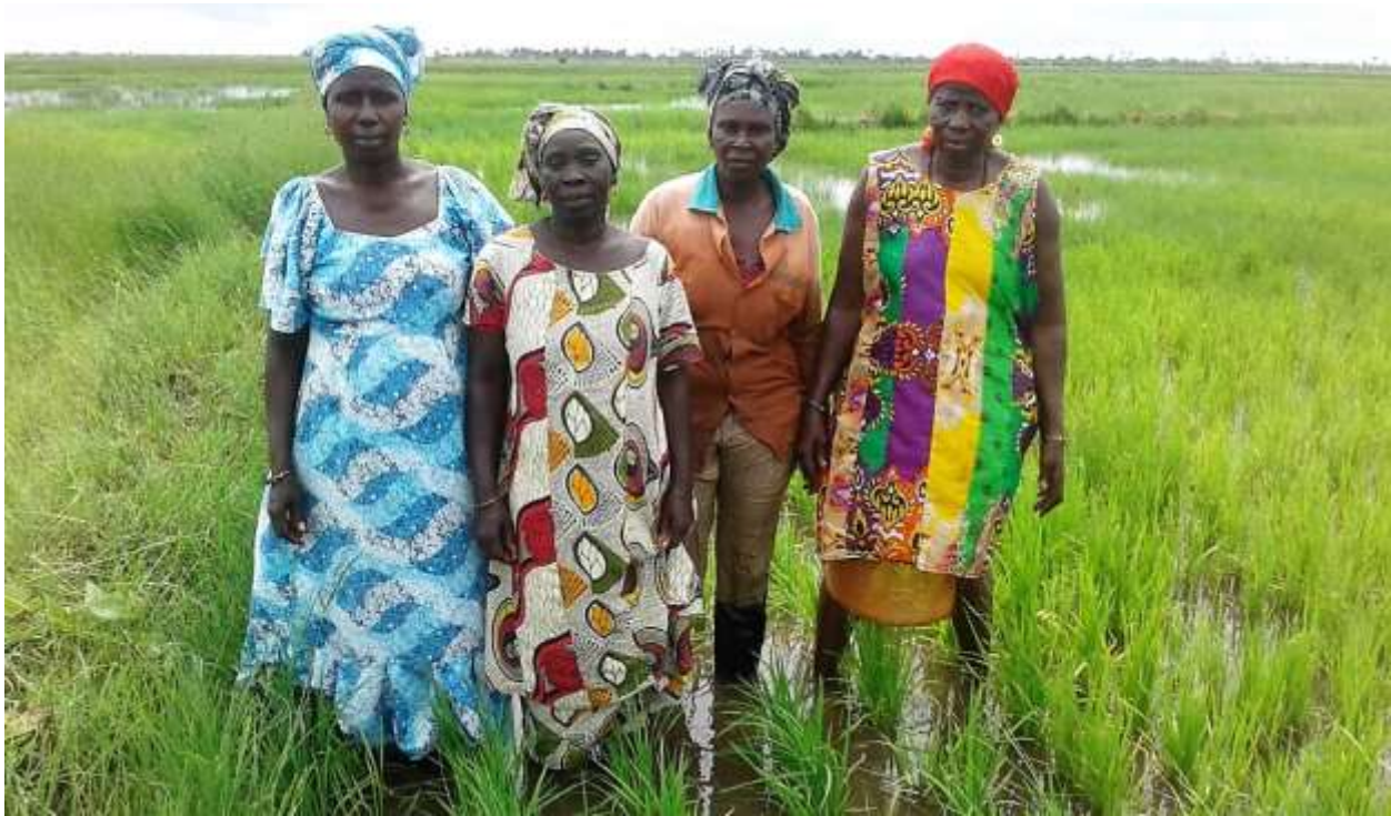
Rice farmers in Senegal.

CLIMATE CHANGE MAKES LIFE harder for Senegalese farmers in many different ways: shorter rainy seasons, more frequent and longer dry spells and droughts, a lower water table, floods, coastal erosion, destruction of mangroves, and disruption of fish stocks. But most pernicious of all is the salinization of soil across large tracts of coastal and riverine farmland.