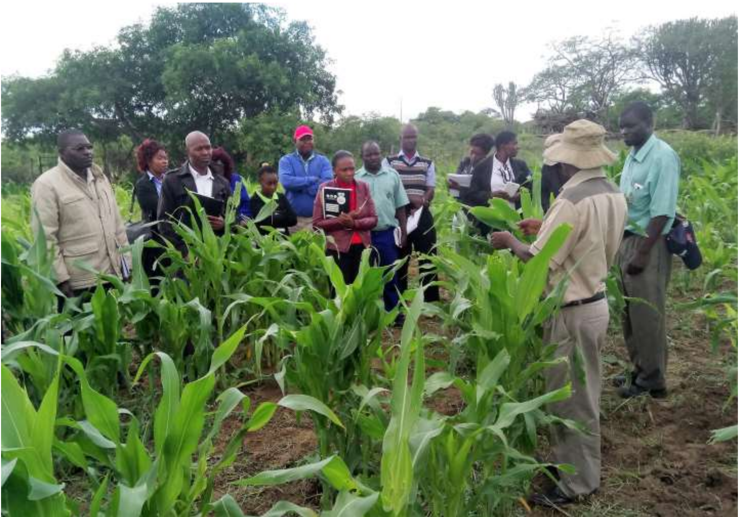
Researchers train agricultural extension workers about the pest.

But he warned that it could take several years to develop effective methods to control the pest.