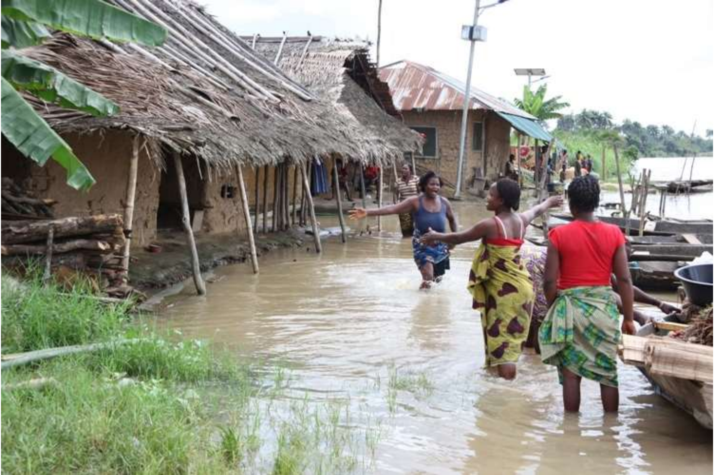
Toru-Orua in Sagbama local government area of Bayelsa state.