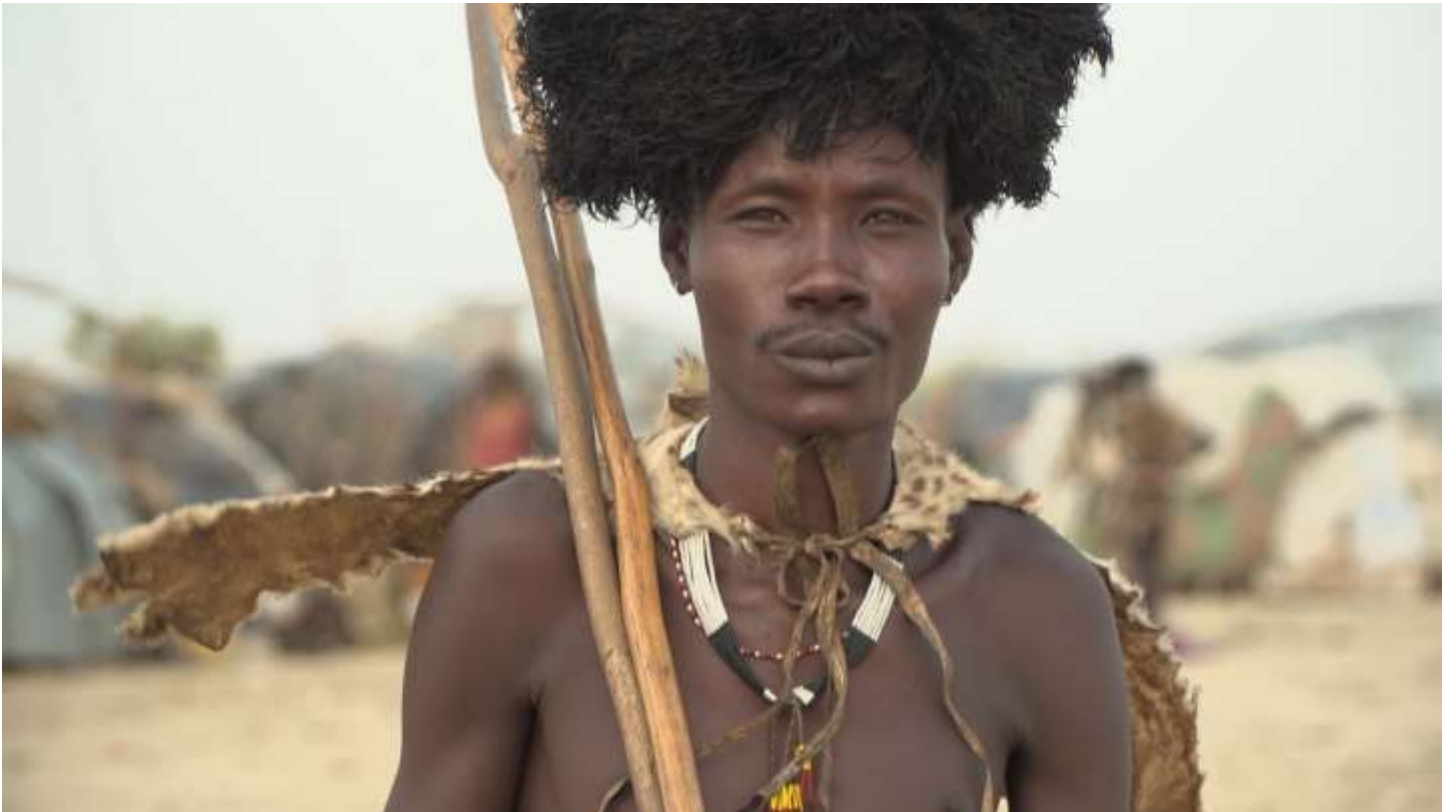
A Dassanich man prepares for a coming-of-age ceremony held once every three years.

One major obstacle is the lack of a bilateral accord between the two countries to govern trans-boundary water, without which it is difficult, given the political sensitivity of water in this arid region, to address grievances about Lake Turkana.