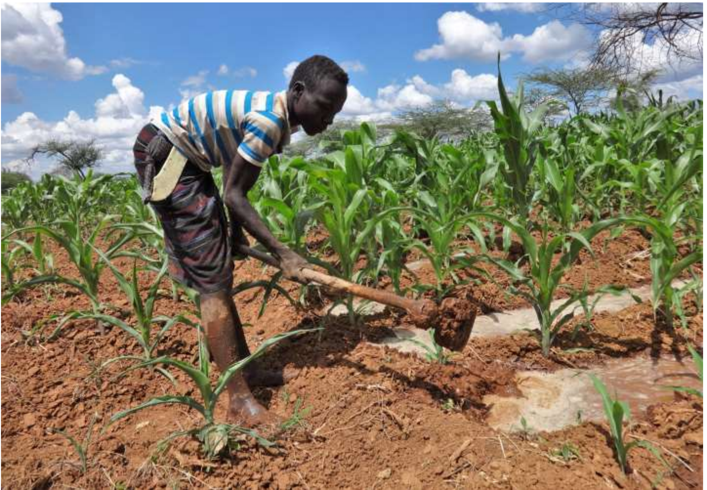
A farmer digs irrigation channels in his maize field.