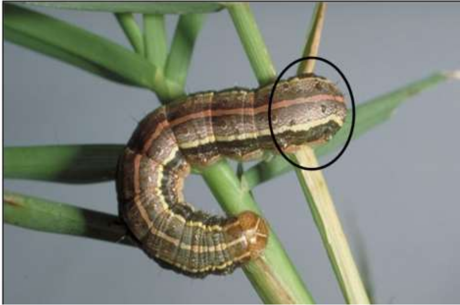
Fall armyworm is identified by the four black dots on the abdomen.

MY BROTHER IS A ZIMBABWEAN farmer who has done pretty well for himself, but is now a worried man.