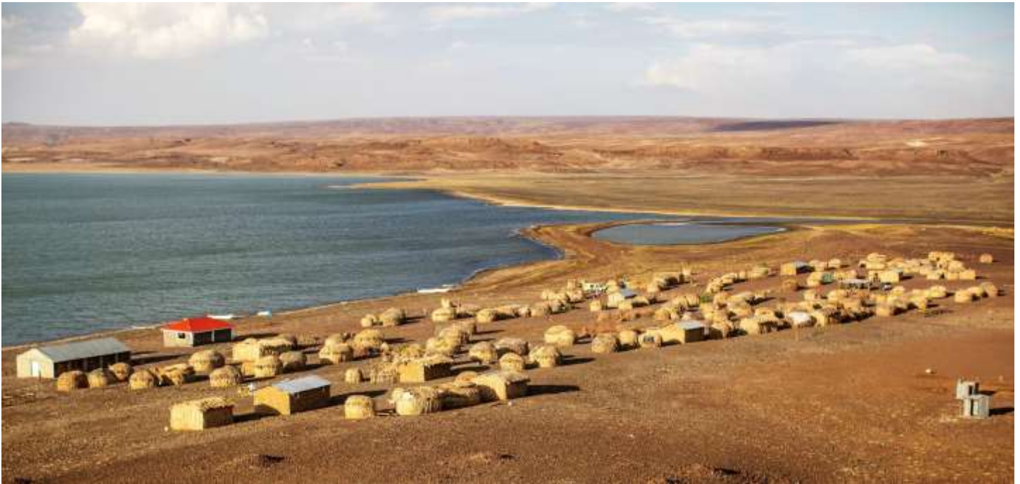
Layeni, on the shore of Lake Turkana.

THE LAST NATIVE SPEAKER of the Elmolo language reportedly died sometime in the 1970s. By then, only a few hundred Elmolo remained, eking out a living on Kenya's southern waters of Lake Turkana as they always had, drinking its brackish waters and fishing for catfish, tilapia, and Nile perch.