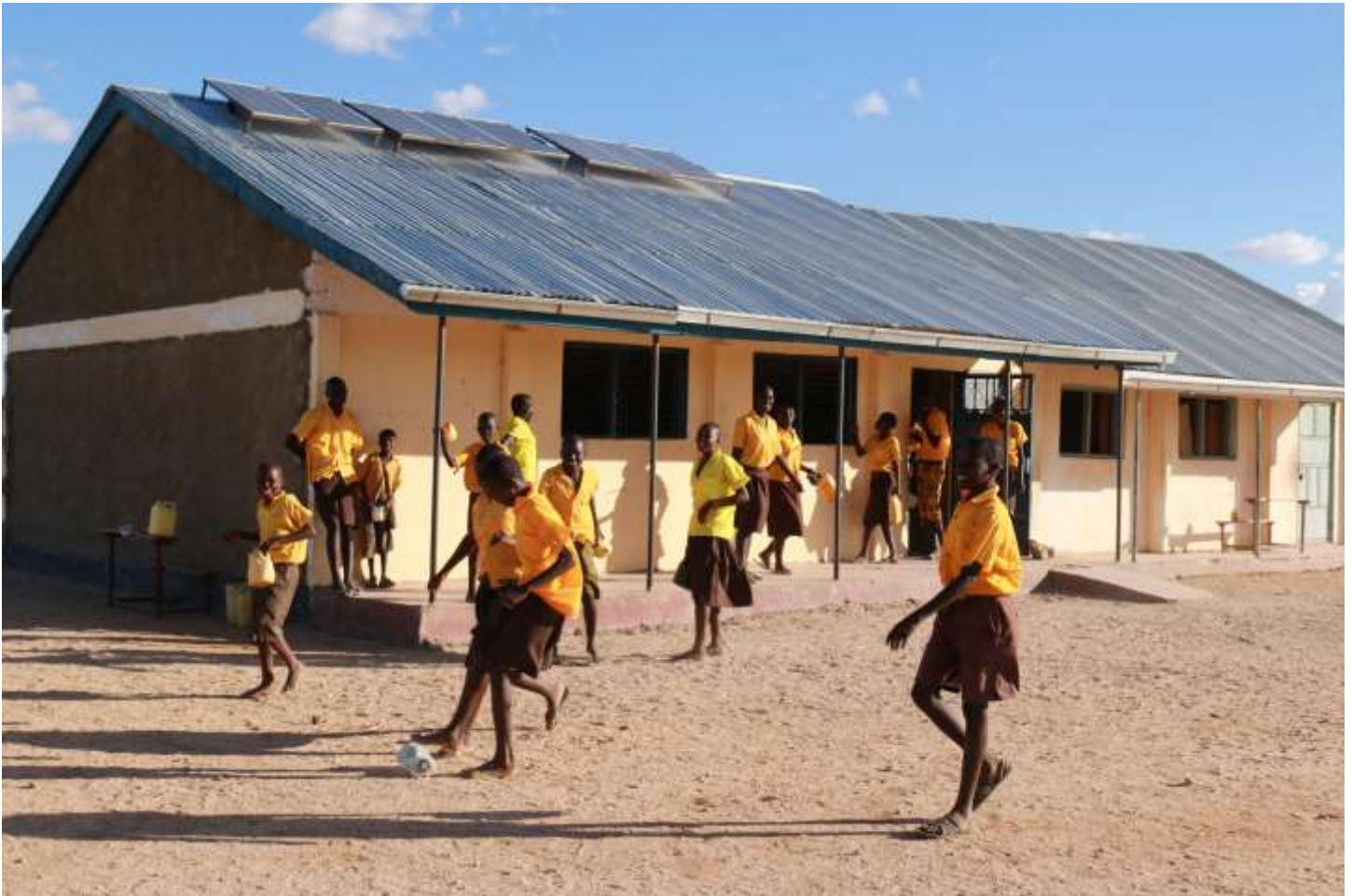
Break time at Karoge Primary School.

LIVESTOCK IS SO CENTRAL to the economy, food, and status of pastoralists in Kenya's northern drylands that formal education has traditionally taken second place to the role children play in tending to cows, goats, and sheep.