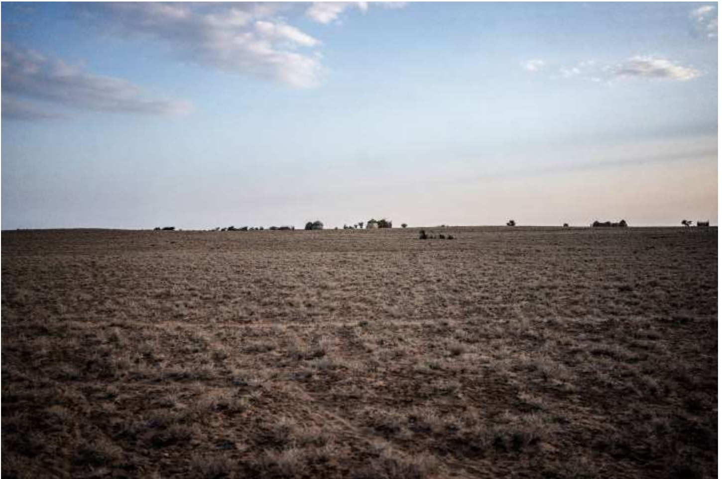
Withered pasture in Turkana County.

EVEN AT THE BEST OF TIMES , the people of Turkana live on the edge. Almost all of the 1.3 million inhabitants of this arid county in northwest Kenya endure extreme poverty. Malnutrition rates are among the highest in the country. Since much of the land here is unsuitable for agriculture, most of the population raises livestock, herding animals long distances to find good pasture and plentiful water.