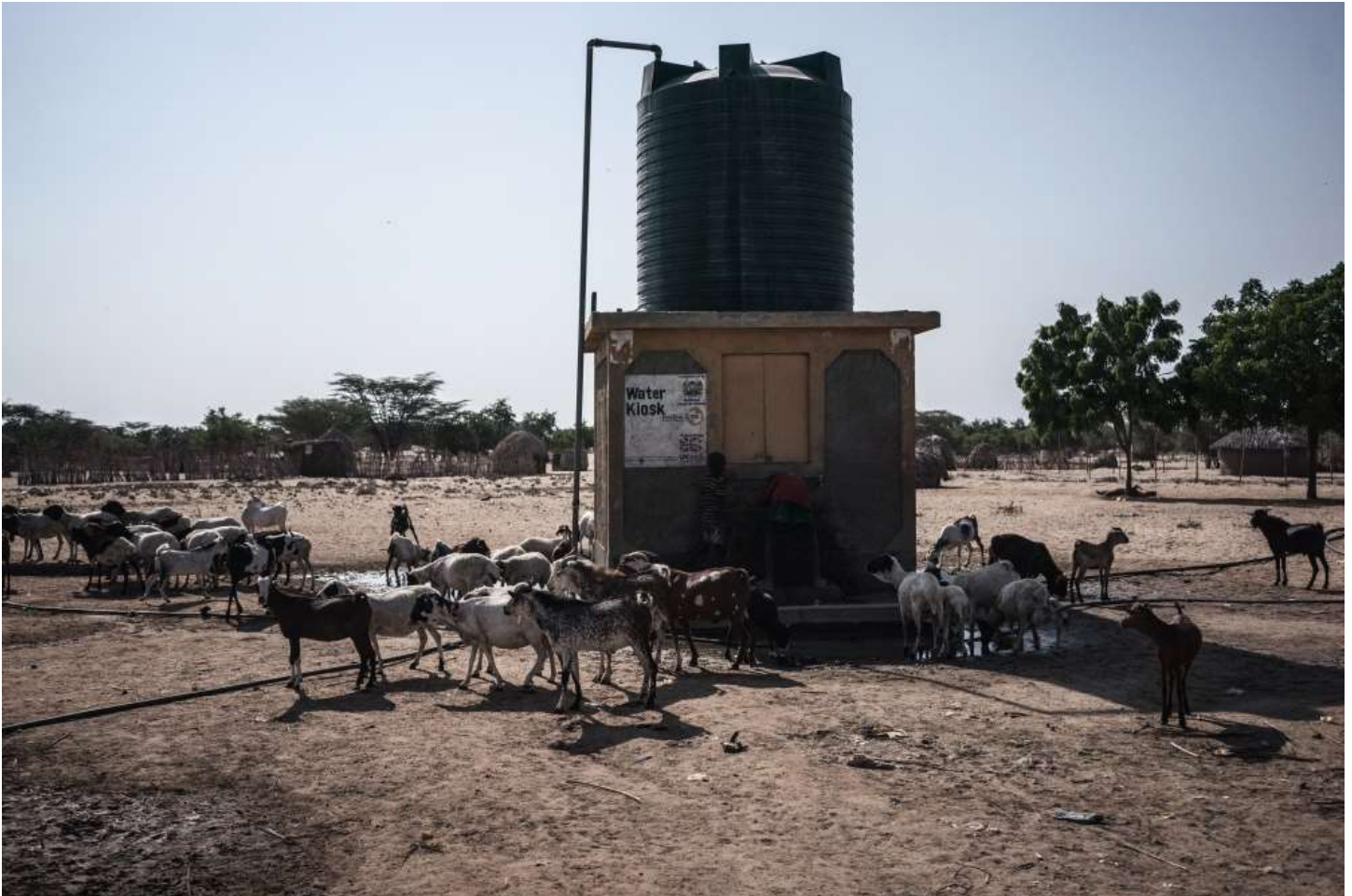
Without water points like this, many more animals would die.

The paper’s authors add that Kenyan pastoralists are particularly “sensitive” because their livestock “depends on the availability of water and pasture which is negatively affected by climate change”.