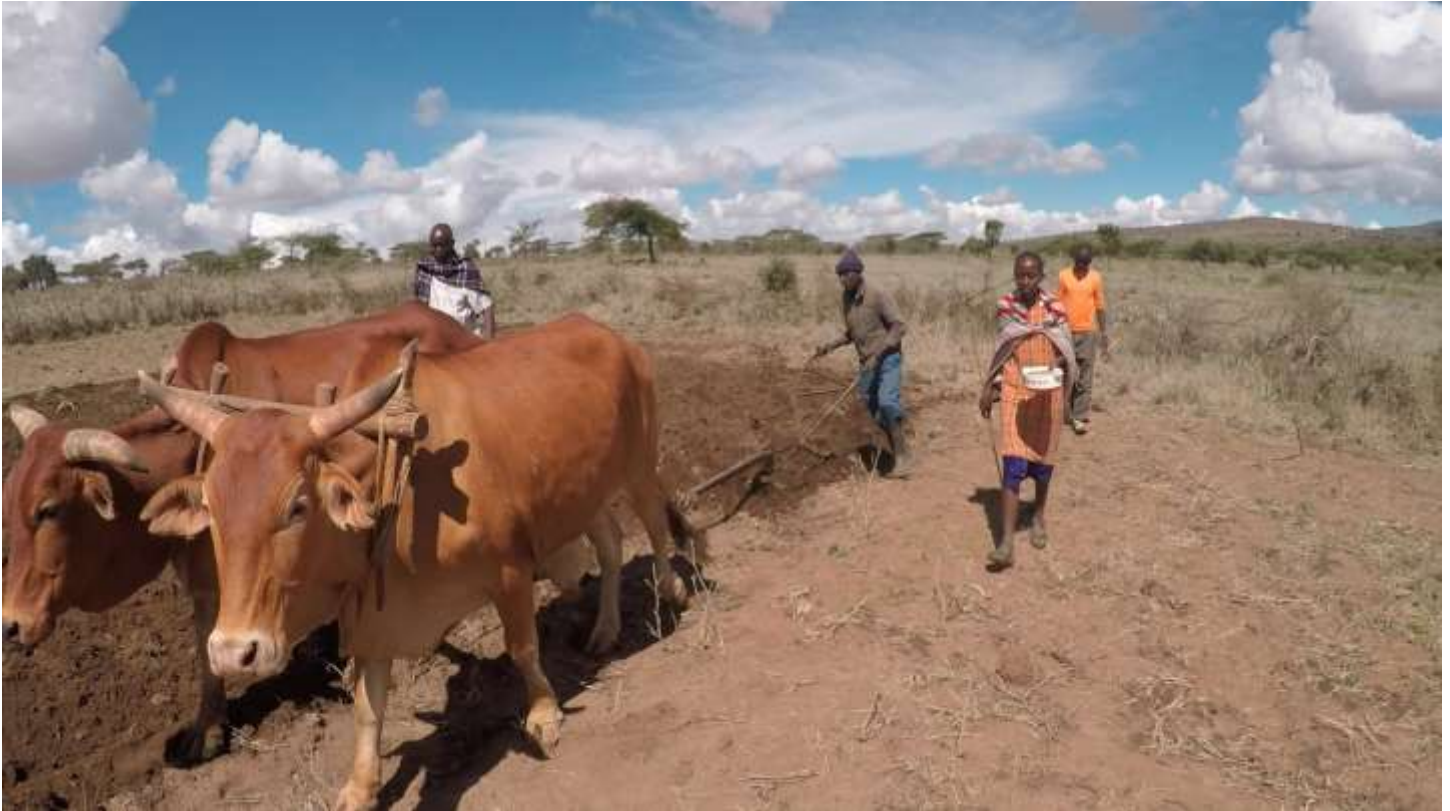
This farmer lost his entire maize crop to drought in 2016.

ACCESSING CREDIT HAS LONG been a major hurdle for small-scale farmers in Africa, who produce some 70 percent of the continent’s food. Not only does this mean yields fall far below their full potential, but the ability of farmers to manage the increasingly frequent and severe weather shocks brought about by climate change is also greatly reduced.