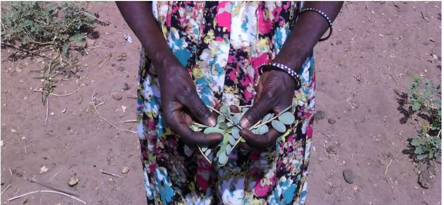
A woman in the commune of Kaymor shows leaves of the leydour plant.

IN INDIA, ITS DRIED LEAVES are used as a hair conditioner; in east Africa it's fed to livestock; Mauritians smoke its seeds; and in rural Senegal, where it goes by the name of leydour, its medicinal uses are helping many make up for the agricultural losses brought about by climate change.