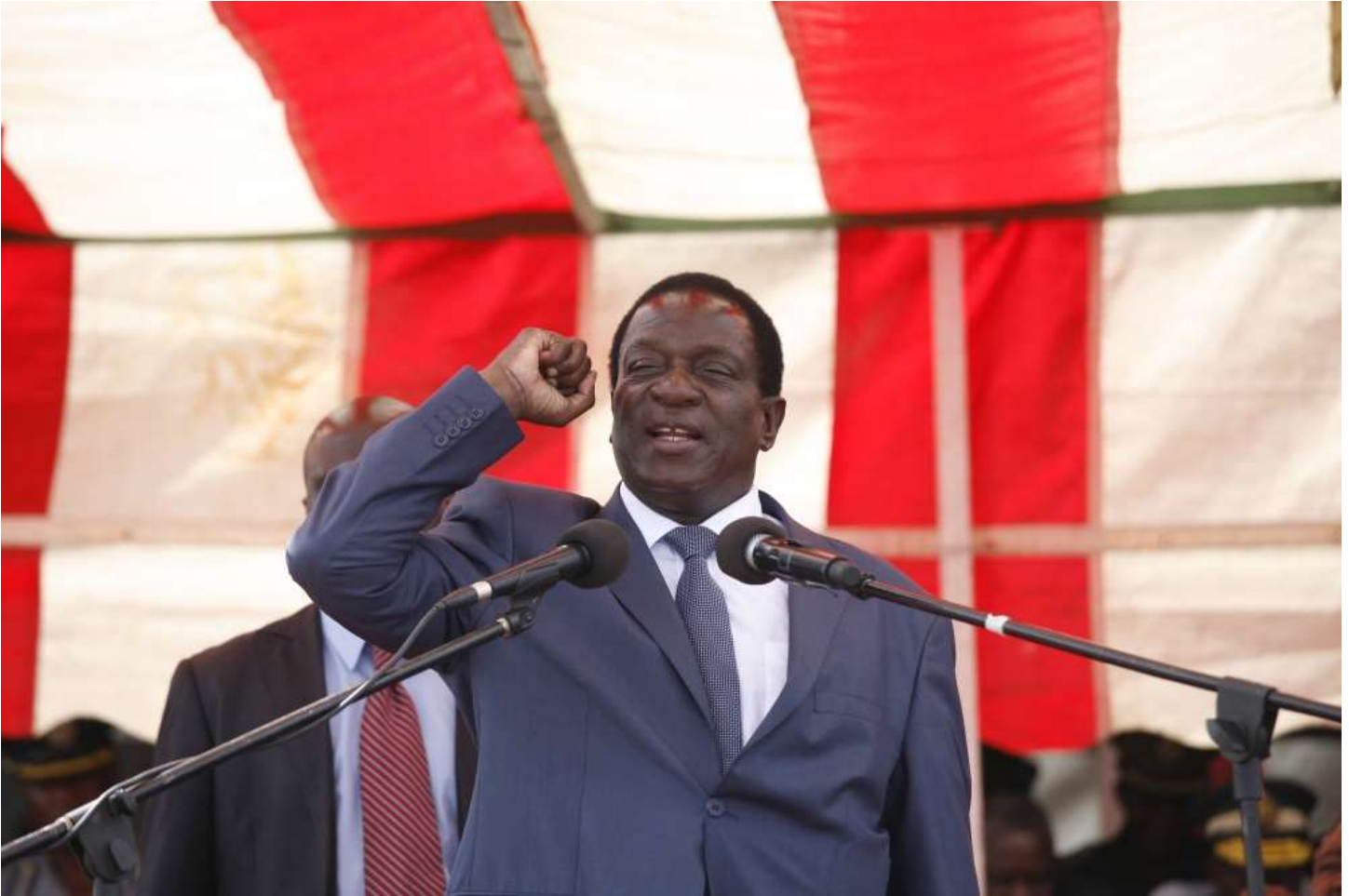
Newly installed President Emmerson Mnangagwa is doubling down on "command agriculture".

In 2007, the Reserve Bank introduced a Farm Mechanisation Scheme, but the equipment seemed to go mainly to the well-connected, was widely viewed as corrupt, and again failed.