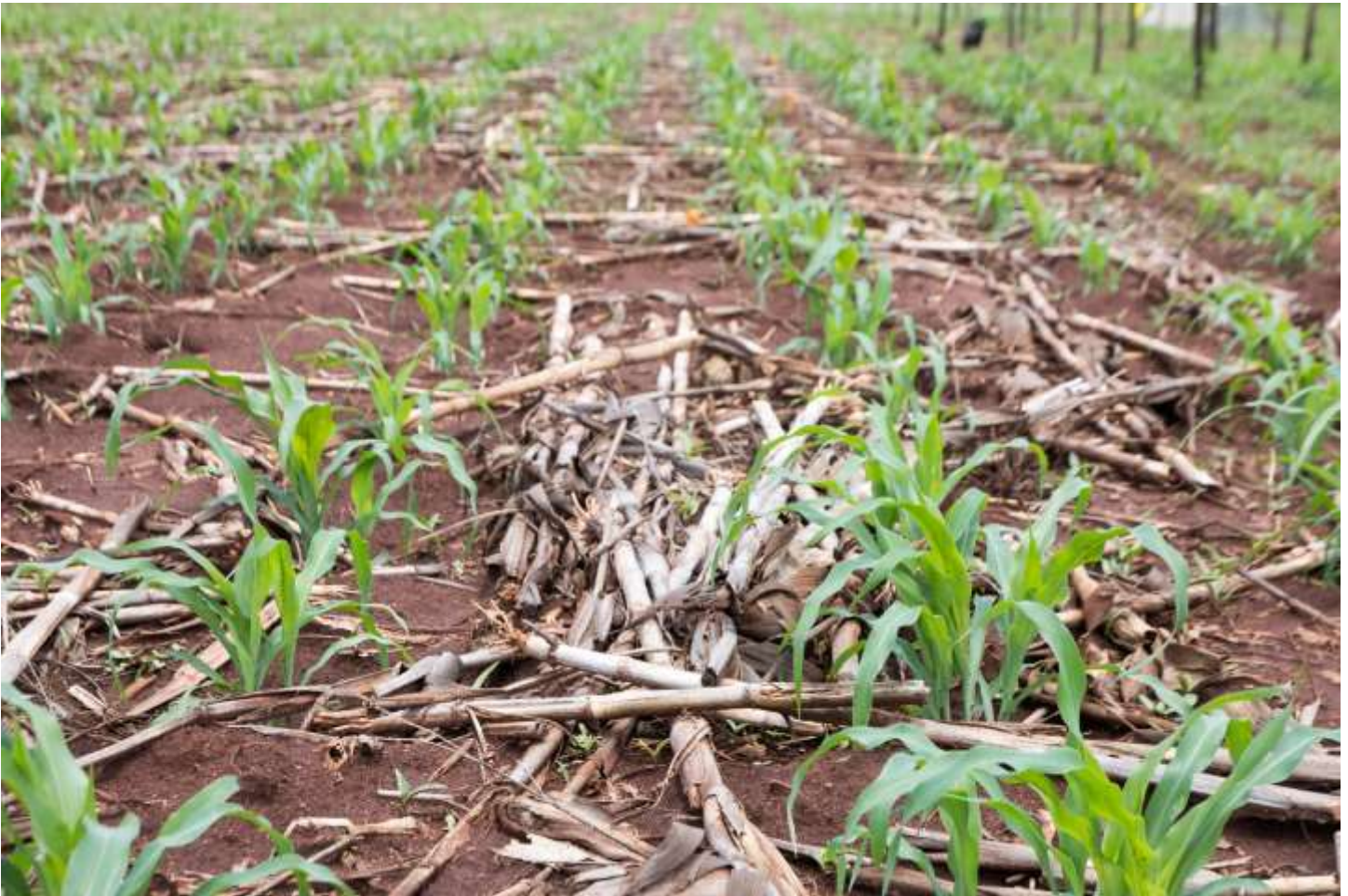
One form of conservation of conservation agriculture.