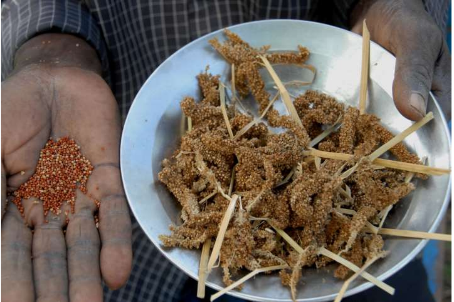
Finger millet is one of the neglected minor millets that thrive in harsh conditions.

MAIZE SEED IN DROUGHT-PRONE regions of Zimbabwe should by now come with a government health warning: “Planting can seriously damage your well-being”.