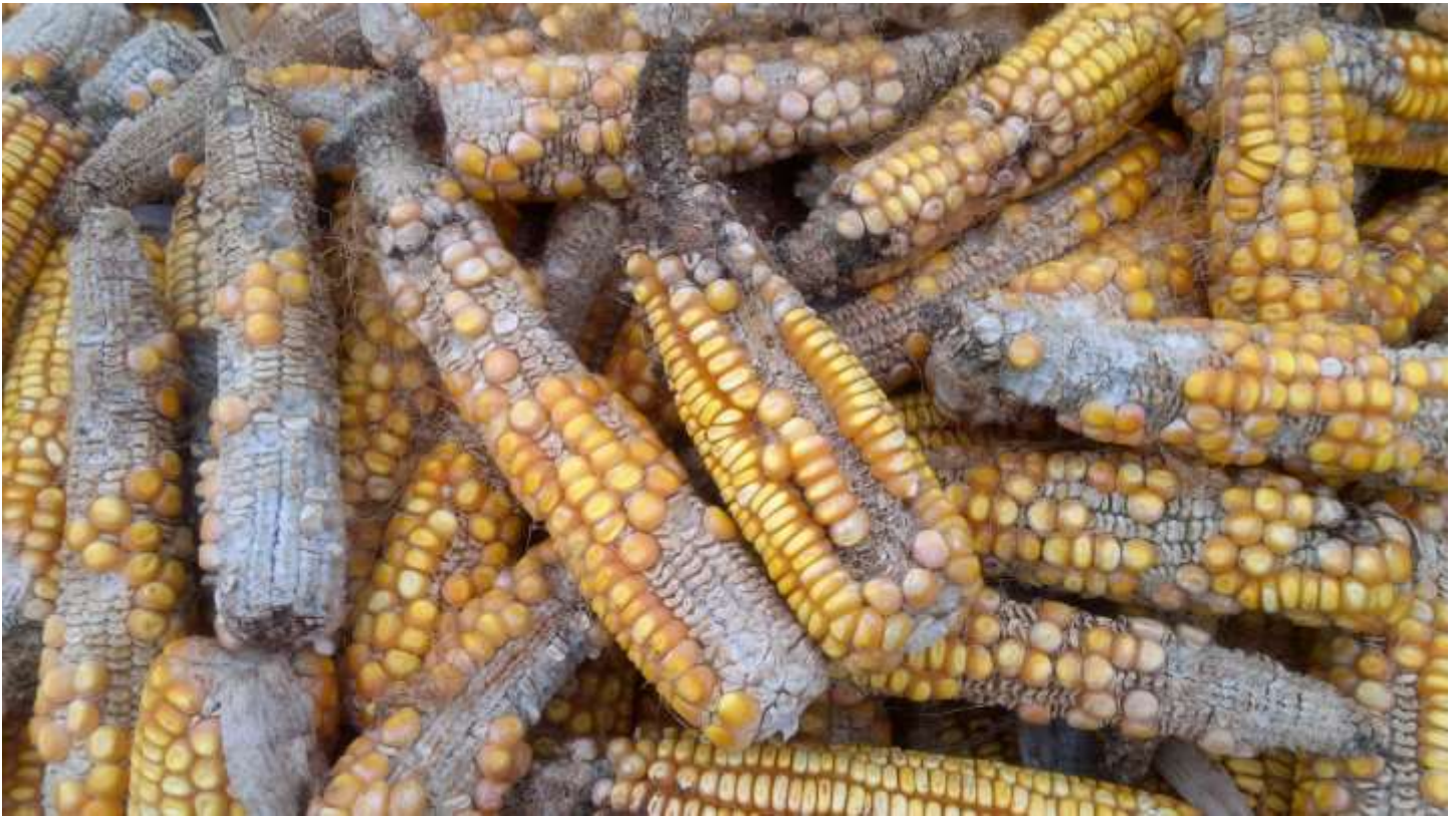
Army worm can devastate maize crops.

IT WAS FIRST DETECTED in Africa in 2016, yet the fall armyworm, a type of caterpillar whose name derives from its tendency to maraud in vast numbers, had by early the next year already infested hundreds of thousands of hectares of maize across more than a dozen countries on the continent, presenting a serious threat to food security.