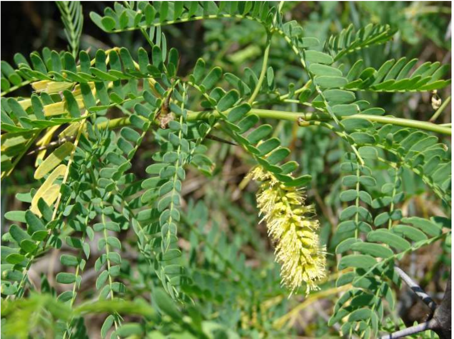
Prosopis juliflora.

IN 2006 A TOOTHLESS GOAT made legal history in Kenya – and headlines around the world – when it appeared in court as part of a bid to sue the government over a plant deliberately introduced a few decades earlier to help rural communities adapt to drought. That plant became an invasive alien weed, and it is still causing havoc to this day in the country's drylands.