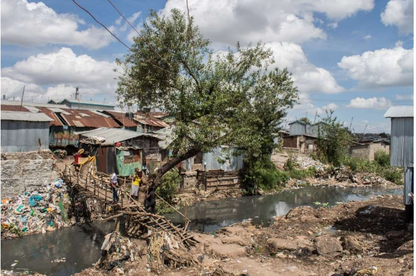
When the river floods it gets a lot worse.

First they “profiled” Mukuru, counting people and households. Then they sat down with the residents to imagine a new, better design for the community’s infrastructure. With an agreed plan, they can engage the politicians, who had previously ignored their needs.